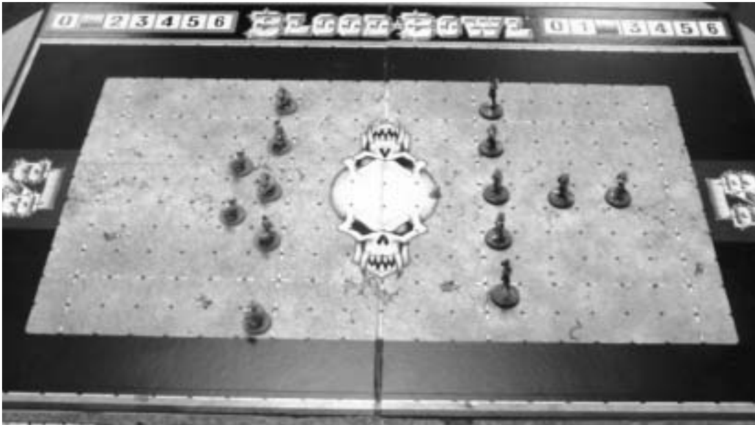
Dwarf and Elf teams line up for the kick off.